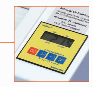
Microcontroller with LC-display